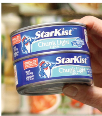
Canned Fish & Meat