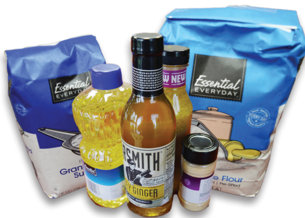
Cooking & Baking