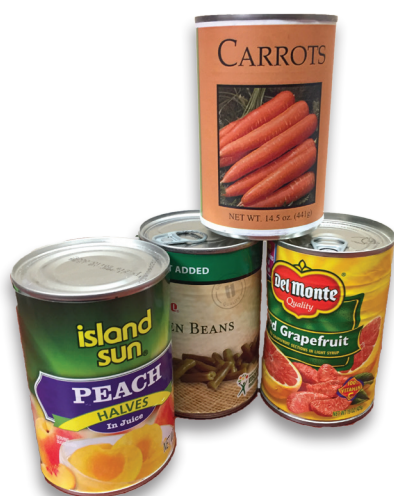
Canned Fruit & Vegetables